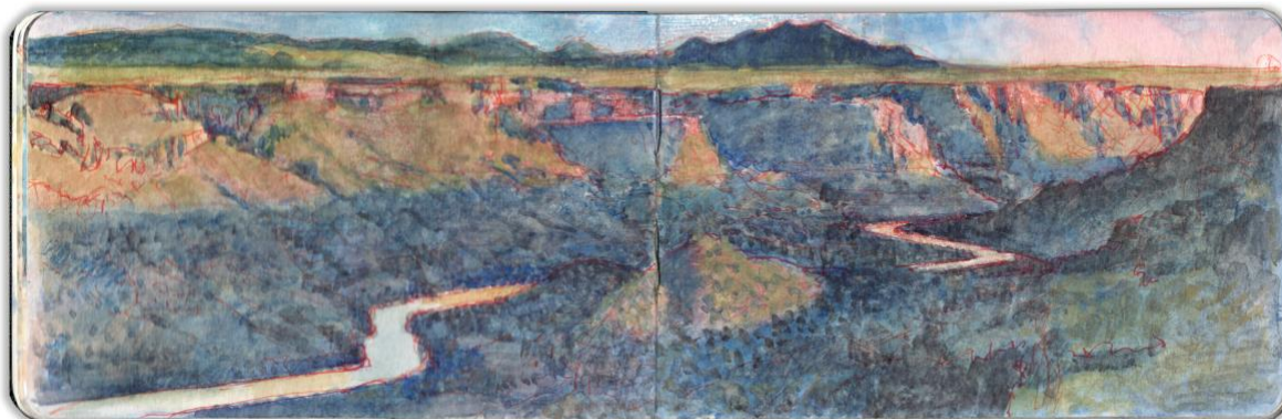
Late Light. The Rio Grande Passing Through White Rock Canyon. SSE from 36.8261 -106.1802. March 7, 2019. 5:30 pm