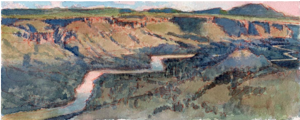
Looking SSE from SSE from 36.8261 -106.1802. March 11, 2019. 5:00 pm. Watercolor and pen on Arches block paper. 3.9 x 9.8 inches.