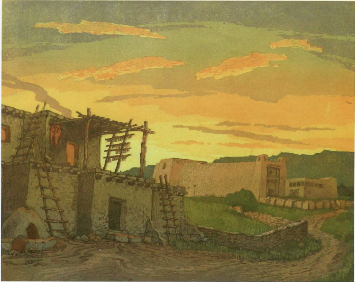
LEON LOUGHRIDGE, Cicuye Morning , woodblock, edition of 14, 16 x 20 inches