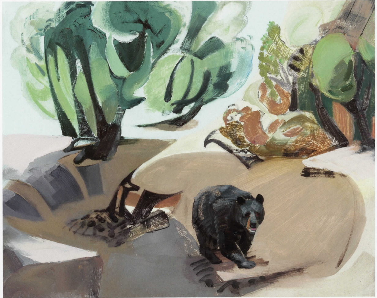
MIKE GLIER, Arroyo Walk: Santa Fe, New Mexico , 2019, oil on hardboard, 11 x 14 inches