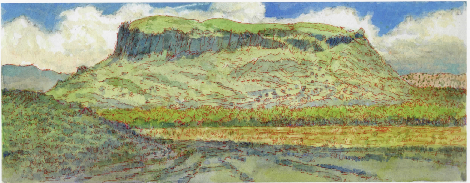
JAMES MCELHINNEY, Black Mesa , 2019, etching with watercolor, 4 x 10 inches