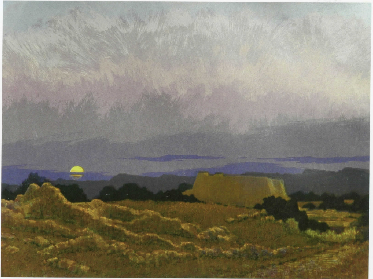
LEON LOUGHRIDGE, Pecos Sunrise , serigraph, edition of 22, 18 x 24 inches