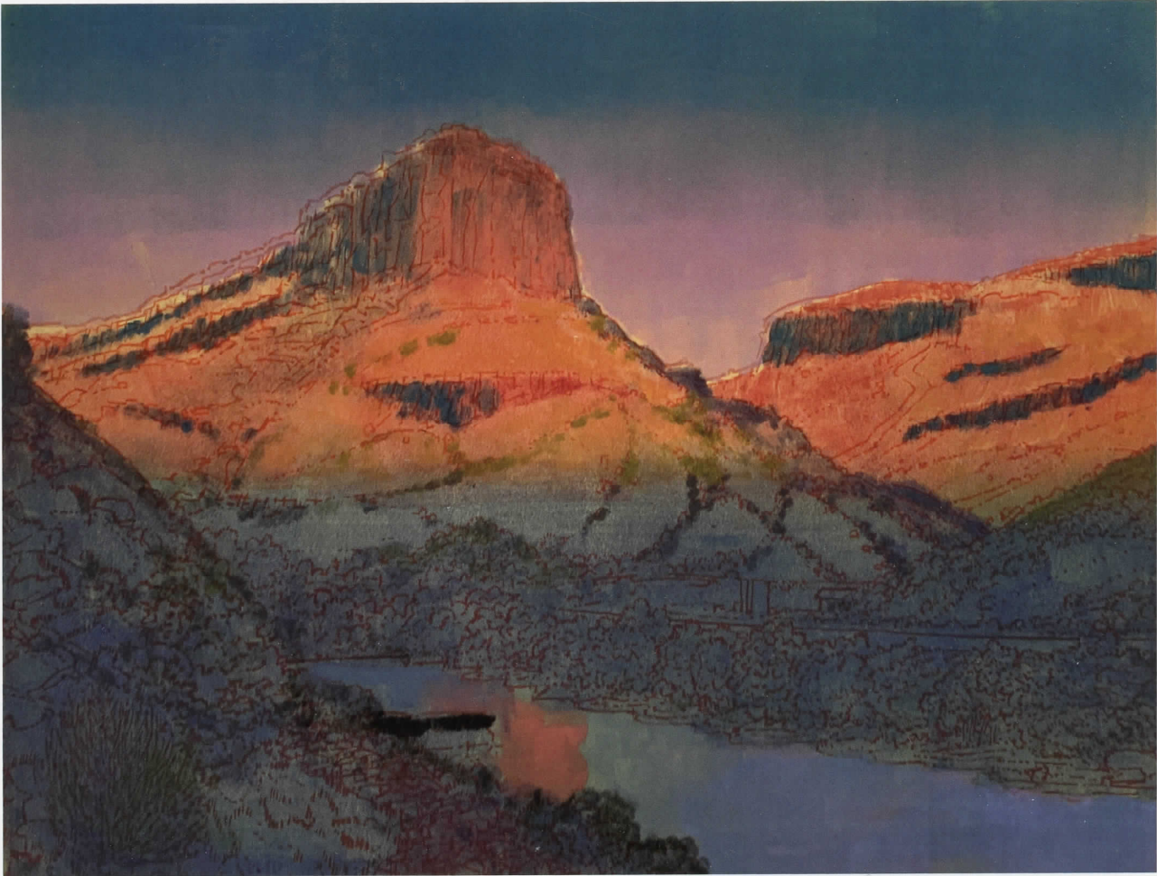
JAMES MCELHINNEY, Confluence 4 , (Rio Grande & Rio Pueblo de Taos), monoprint with chine-collé and mixed media, 22 x 30 inches