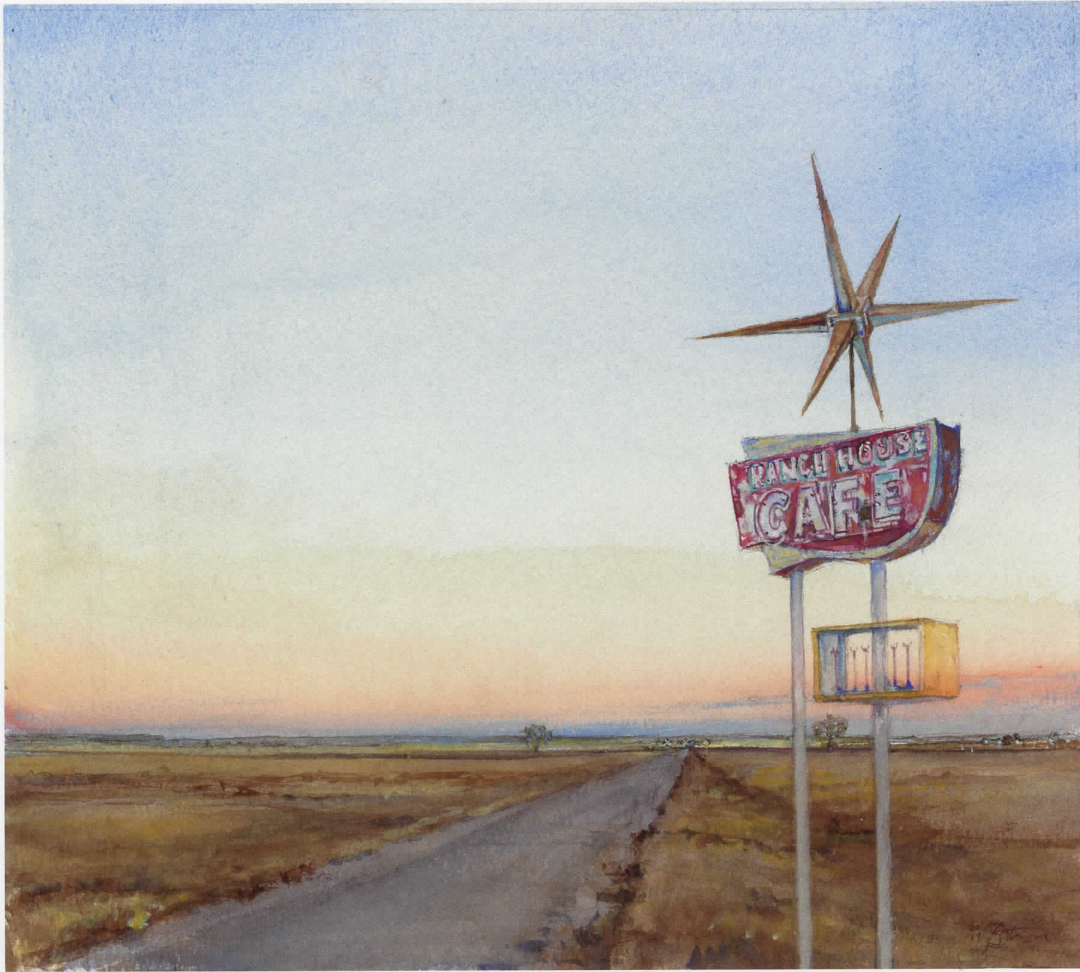
DON STINSON, Ranch House Café , 2019, watercolor on arches paper, 13 ½ x 14 ½ inches