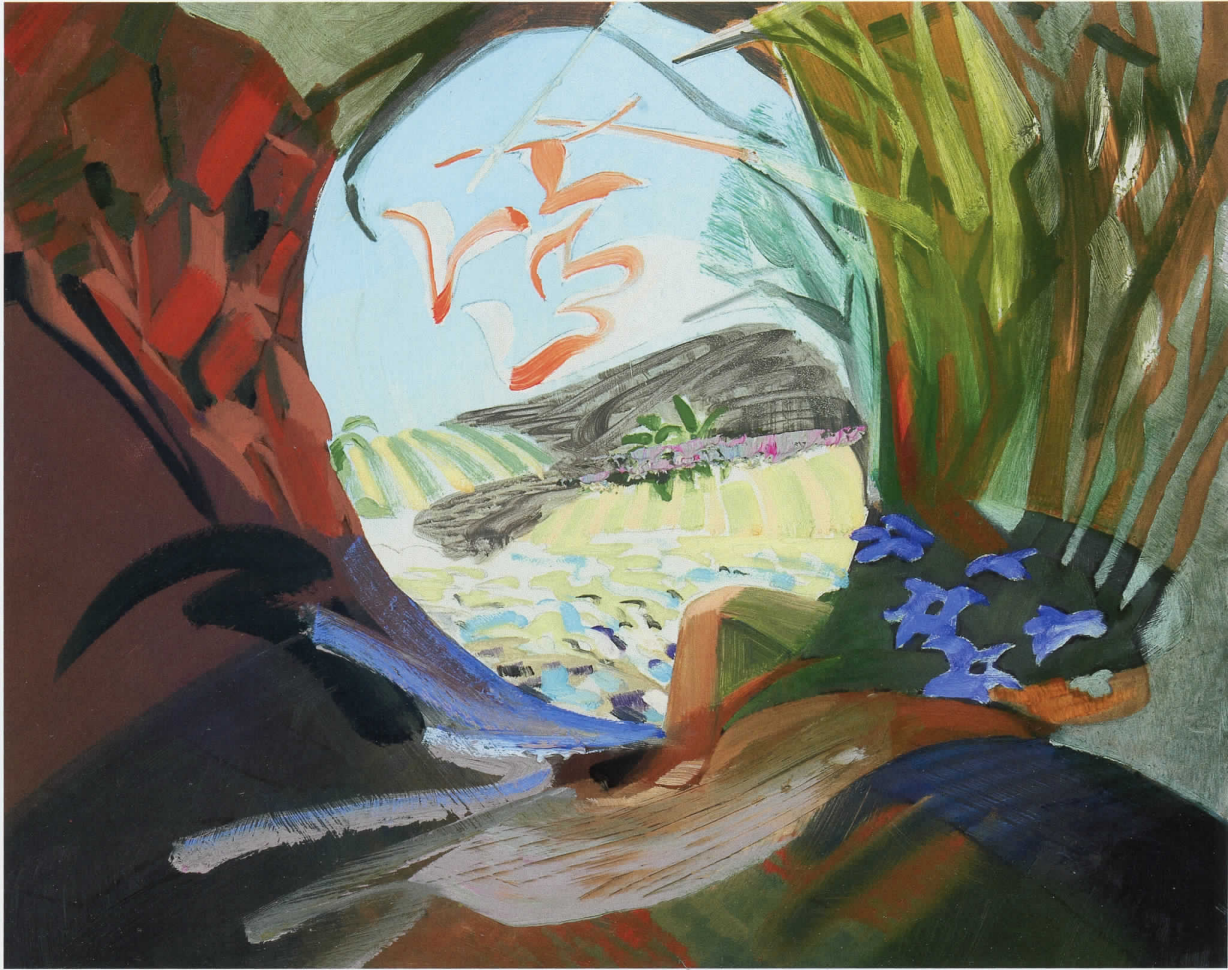
MIKE GLIER, Stream Crossing on the Columbine Trail: Carson Forest, New Mexico , 2019, oil on hardboard, 11 x 14 inches