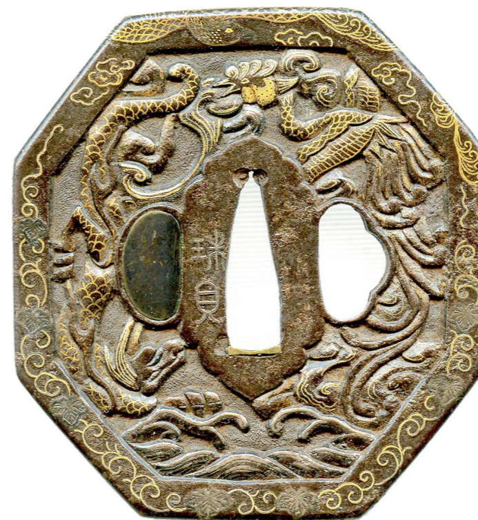
Fig. 11 Sword guard By Shugai (act. late 17th century), Japan, Nagasaki, late 17th century Iron with silver- and gold-wire inlay and foil overlay, 8.35 x 8.35 cm Asian Heritage Museum, New York