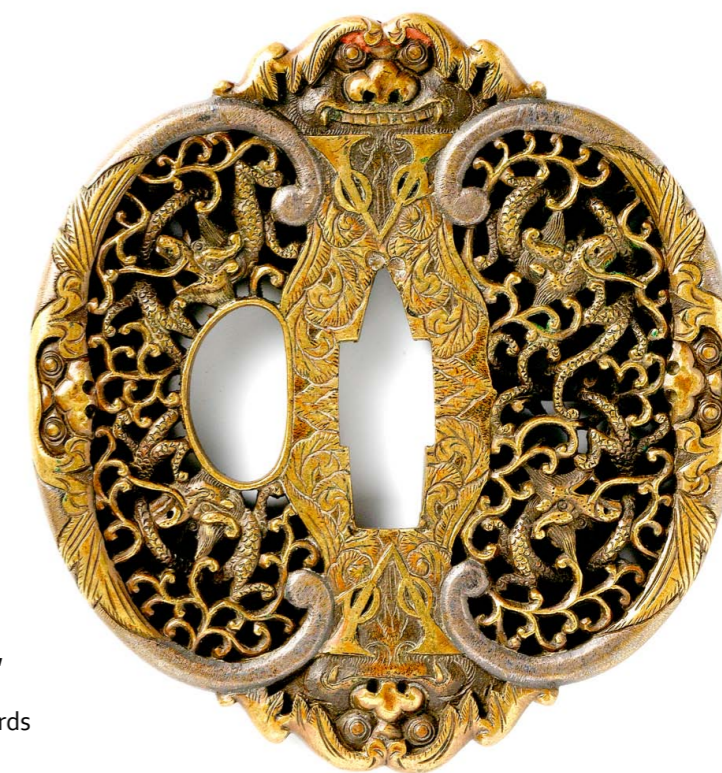
Fig. 3 Sword guard Sri Lanka, 1600–1900 Copper alloy, 7.9 x 7.4 cm Rijksmuseum, Amsterdam On loan from the Asian Art Society in The Netherlands (AK-MAK-1145)

... should not go destitute of any things which come from our native land ... I will mention some here which will not be very expensive. (1) A complete stand of arms,