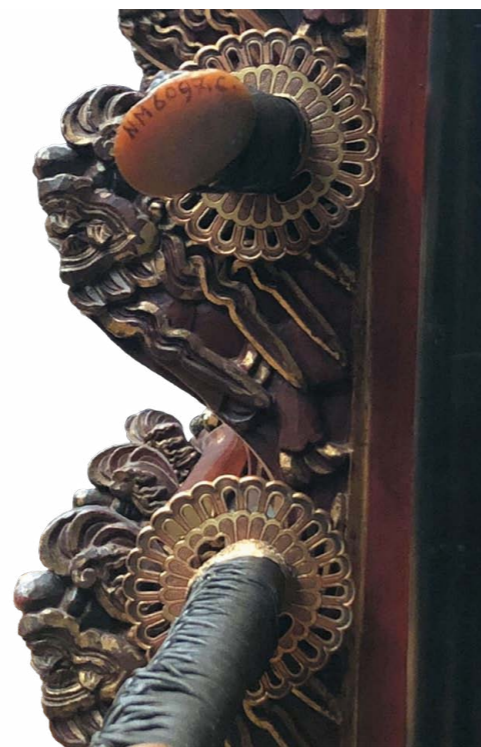
Fig. 5a Side view of the weapons rack in Figure 5b

requested an ornate firearm in an unusual calibre. Discovering that none was on hand in the armoury at Batavia (today's Jakarta), the company sent a wood model of the gun to its factory in Sri Lanka to have the gun made there. Comparison of 17th century Sinhalese kastane (single-edged swords) and 18th century small-sword garnitures produced in Galle for the European market with some of the sword guards classified in Japan as Nanban ('southern barbarian') suggests that the latter, too, were made in Sri Lanka. The sword guards shown in Figures 2 and 3, both made in Sri Lanka in the Japanese style, were inspired by European small-sword guards and also combine Western and Chinese design elements. Both have a design featuring taotie (zoomorphic masks) and dragons, Figure 2 in openwork (Ch. loukong ). The sword guard in Figure 3 also bears the VOC cypher. The tsuba in Figure 4 with a design of dragons and shishi (lion dogs) illustrates a technique, atypical of Japanese work, used to apply copper-alloy highlights to carving in high relief. Comparable decoration has been seen on Sinhalese kastane dated circa 1650–1700.