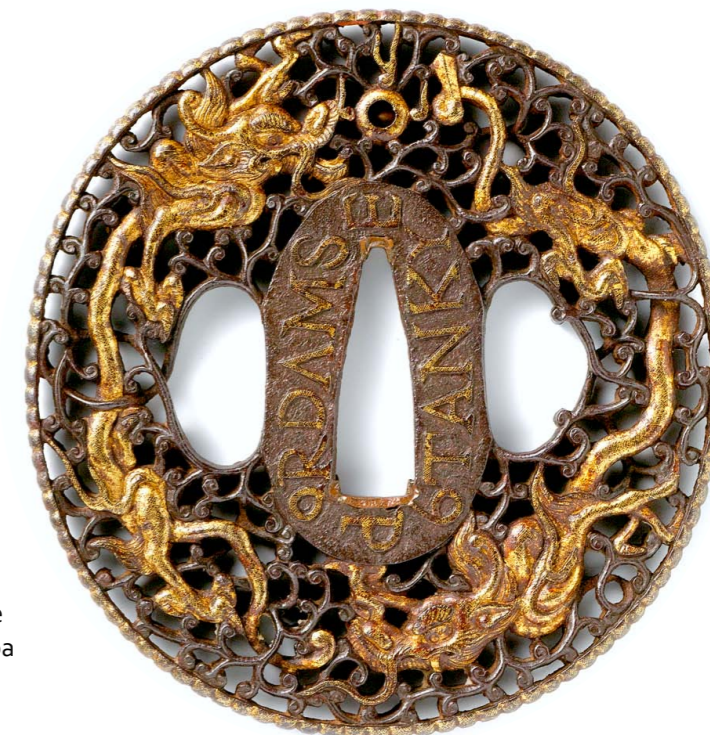
Fig. 8 Sword guard Japan, Hirado or Nagasaki, 1600–1900 Iron and gold, 7.6 x 7.3 cm Rijksmuseum, Amsterdam On loan from the Asian Art Society in The Netherlands (AK-MAK-1146)

seems to have peaked in the early 19th century, when a limited number of designs were mass-produced as curios.