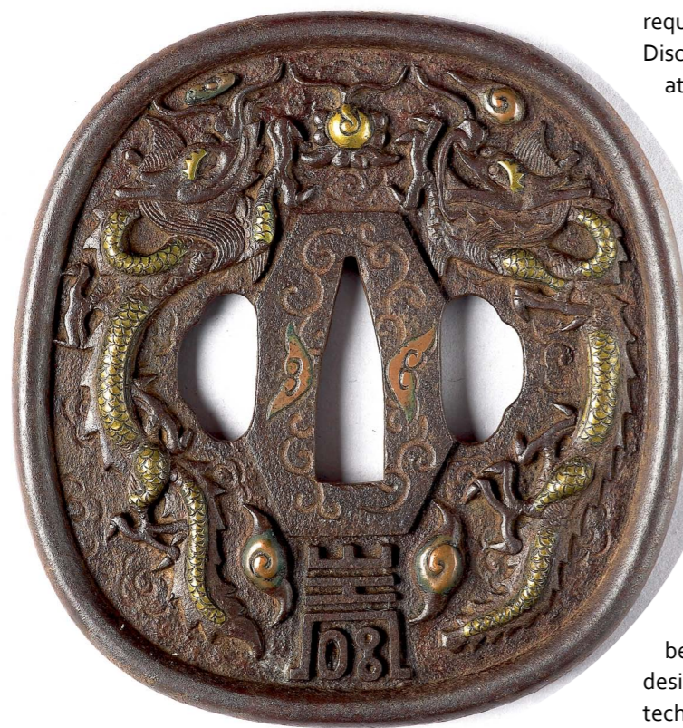
Fig. 4 Sword guard Japan, first half of the 18th century Iron with copper-alloy inlay, 8.8 x 8.3 cm Ashmolean Museum, Oxford Bequeathed by Dame Jemima Church, in accordance with the wishes of her Husband, Sir Arthur H. Church, 1929 (EAX.10819)

well engraved—and if they can be gilded, so much the better. (2) A broad-bladed sword, of a larger size than the ordinary, well mounted, excellently polished, and as valuable as possible. (3) A half-length portrait of our Lord the King, on a painted metal panel measuring a hand's span, with a border of gold, and on the other part of the panel our Lady the Queen holding the Prince by the hand. (4) Two or four pieces of coral of extraordinary size. And finally, some curiosity, which they have never seen or heard of, because that King, lord as he is of so many mountains of silver, more esteems curiosities than any kind of riches.