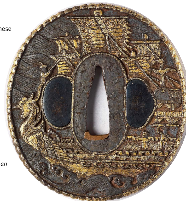
Fig. 12 Sword guard Japan, probably Nagasaki, 18th–19th century Iron and gold Ashmolean Museum, Oxford (EAX.10821)