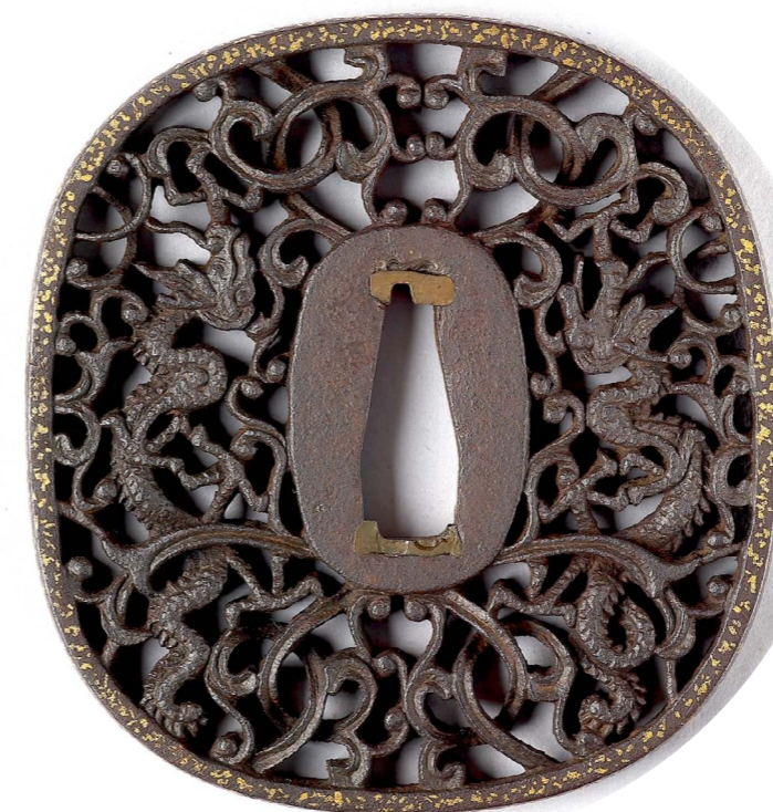
Fig. 7 Sword guard Japan, Nagasaki, 18th century Iron, gold and copper, 8.3 x 7.8 cm Ashmolean Museum, Oxford Bequeathed by Dame Jemima Church, in accordance with the wishes of her Husband, Sir Arthur H. Church, 1929 (EAX.10796)

Nagasaki became a centre of scientific learning where both Rangaku and Chinese medicine were taught. Wearing a Nanban tsuba might be a badge of honour, a status symbol of someone privileged with outside knowledge. In his blog, Markus Sesko cites an early 19th century source that awarded Nanban tsuba high standing. (Sesko, 2016). In the late 17th century, a number of Chinese carvers immigrated to Nagasaki, suggesting that sufficient demand existed for foreign merchants to import their own craftsmen to compete with local artists. The tsuba in Figure 9, with a Nanga (Japanese painting)-style landscape, was made by one such carver, one of three Chinese metalworkers working in Nagasaki, who all used the name Midorikawa-tei. The demand for Nanban tsuba